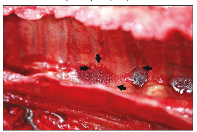
Figure 2. Gross specimen of the trachea. Lipid droplets are grossly visible within the lumen of the trachea (arrows).

of pleural effusion. A series of thoracic radiographs revealed a bilaterally severe, mixed bronchoalveolar-interstitial pattern in the cranioventral lung fields typical of aspiration pneumonia ( Figure 1 ).