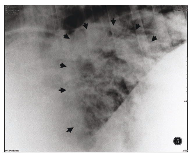
Figure 1. Lateral radiograph of the caudodorsal lung field. A mixed bronchoalveolar-interstital pattern is present (arrows).

As the gelding was less distressed, unsedated resting upper airway endoscopy was successfully performed with no abnormalities detected; however, passage of the endoscope into the trachea was not attempted since the gelding became increasingly agitated during the procedure. It was decided not to re-attempt the procedure under sedation due to the potential cardio-respiratory depressant effects of the sedative agents. Ultrasonographic examination of the thorax revealed bilateral areas of ventral lung consolidation characterised by an uneven surface and numerous pronounced comet tails; there was no evidence