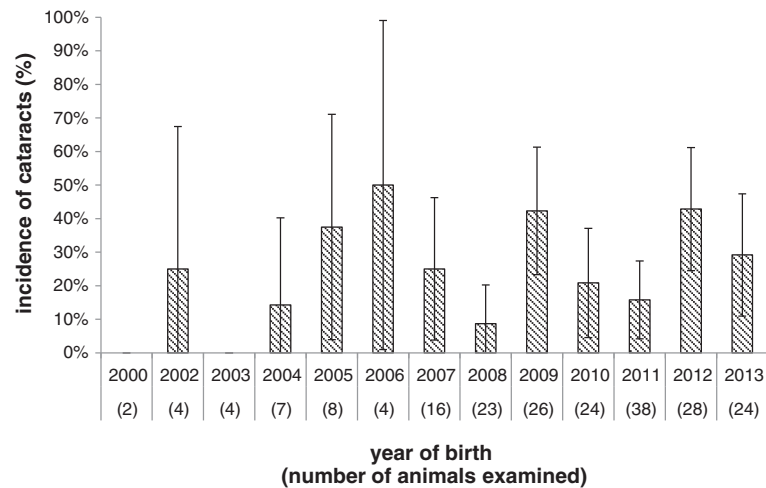
Figure 2 Incidence of congenital cataracts by year of birth with a confidence interval of 95% (represented by error bars).

in 2011. Unlike anophthalmia, mild cataracts can easily be missed with the naked eye. These cataracts are non-progressive. On the contrary, as the lens grows, the effect of the lesion is likely to decrease. That might account for the fact that younger animals appeared more severely affected in comparison to older animals, even though it was not statistically significant. In spite of small number of bulls on this farm, there is a trend showing male animals might be at higher risk for this condition, which is consistent with other reports [13].